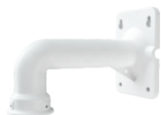
TD-YZJ0808 Wall Mount