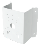
TD-YZJ0601 Corner Mount