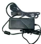
DC24V/2.5A Power Adapter